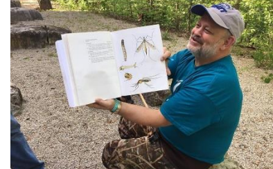
Engaging educators in hands on professional development at KATS Kamp